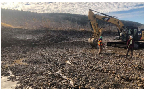
Installation of cuttings

Rough and Loose Soil Treatment is used to control erosion and diversify surface conditions. This technique has allowed us to create ideal conditions to promote re-vegetation and reduce ponding and run-off into our river bank. It also discourages ATV traffic which can cause significant damage through soil compaction.